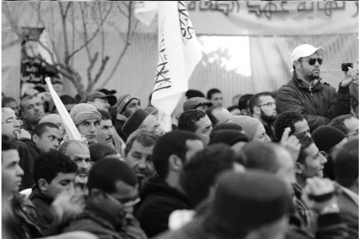
Mukhtarat from Media Office of Hizb ut-Tahrir - Issue 1 - Safar 1433 H