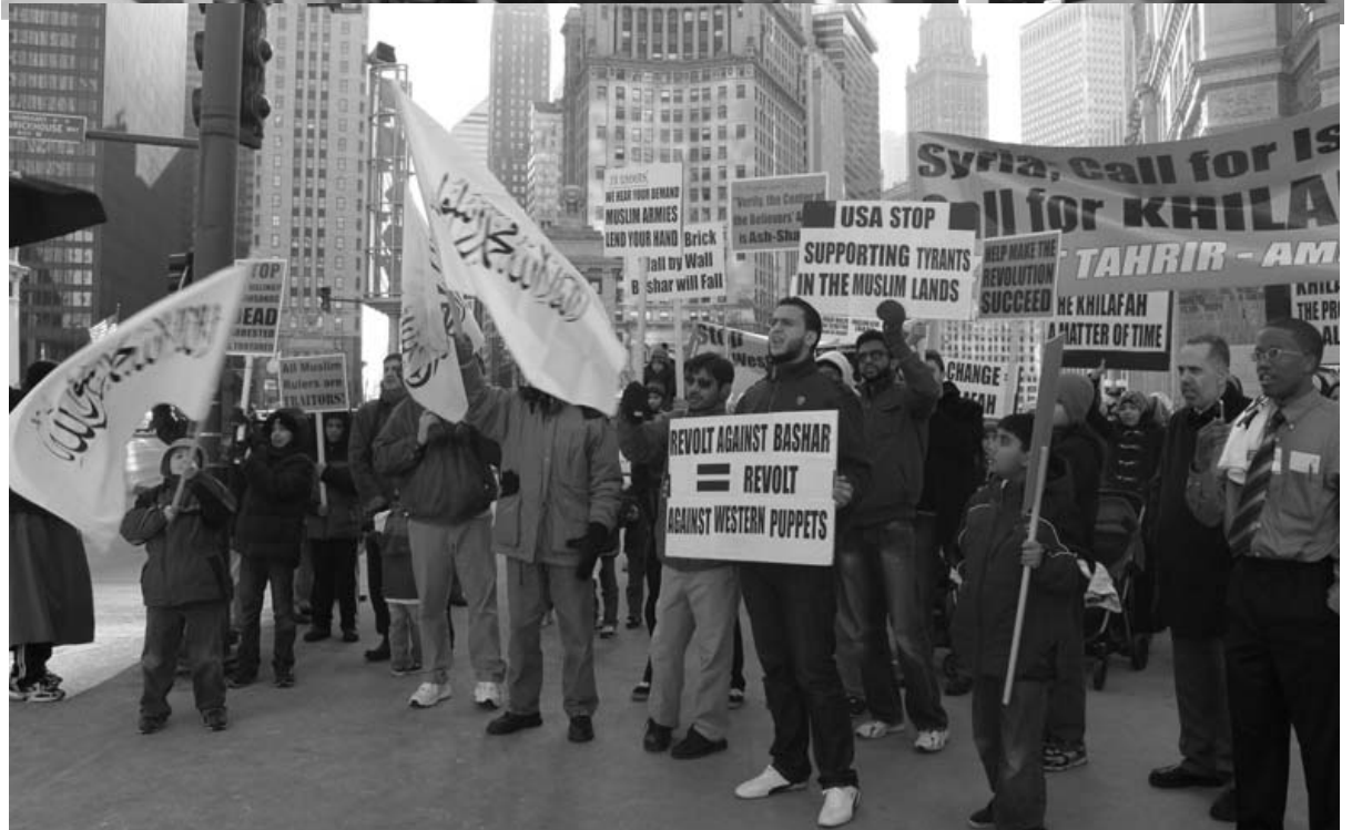
Mukhtarat from Media Office of Hizb ut-Tahrir - Issue 1 - Safar 1433 H